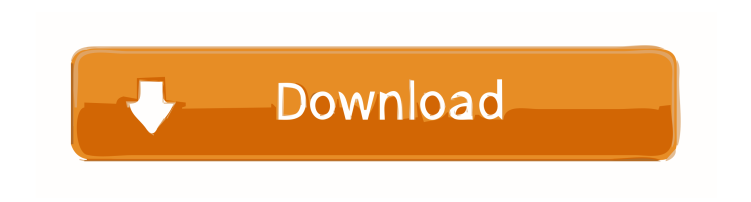
Fluent 6.2.16 Software Free 23